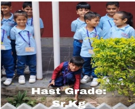
Hast Grade: Sr.Kg